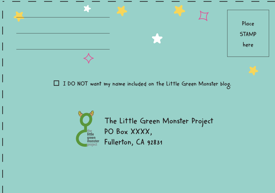
Illustration concept by Jackie Gorman © 2018